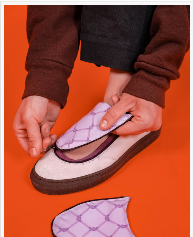
Innovative, multidimensional shoes