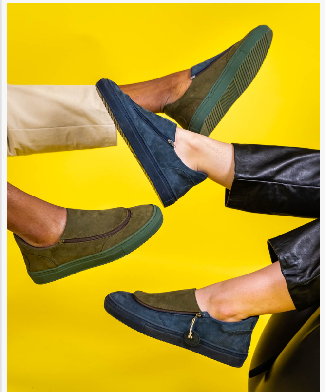
Designed for maximum comfort and durability