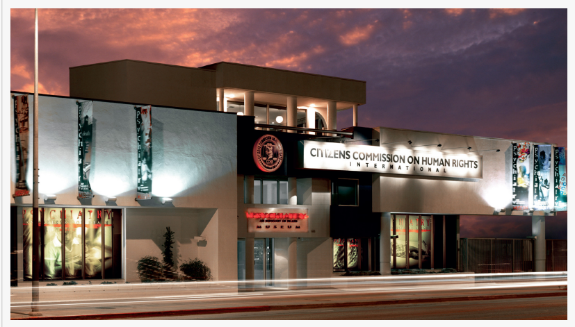
CCHR's mission is to eradicate abuses committed under the guise of mental health and enact patient and consumer protections.

CCHR International says the drugs are being prescribed like candy, despite many of them scheduled by the Drug Enforcement Administration as high risk for abuse and addiction.