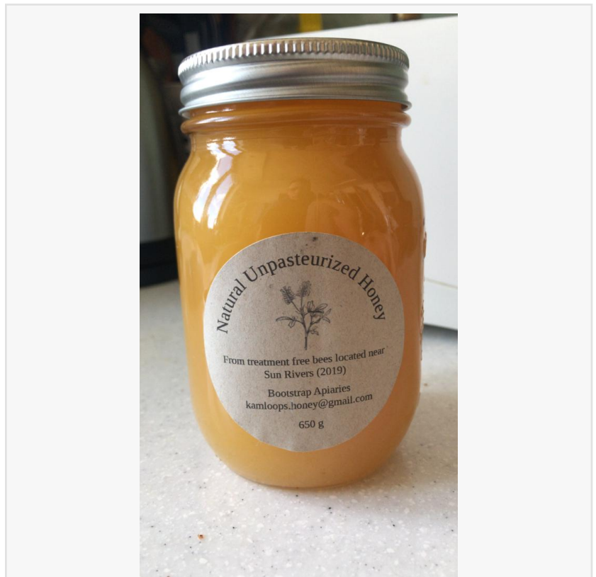
This is Bootstrap Apiaries

The products that we have procured that are relevant to the CIIE: Unpasteurized Honey from Kamloops / North Okanagan of British Columbia Canada.