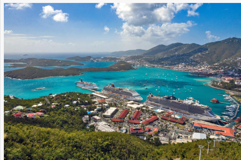
St. Thomas remains a popular destination for cruise ship passengers.

Porthole Cruise Magazine is a leading cruise-travel magazine, available on newsstands and online. St. Thomas respin passengers