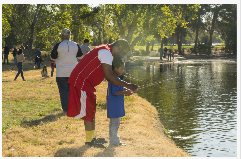
Parents, Scout Leaders and local fishermen helped instill the love of fishing in the youngsters they introduced to the sport.