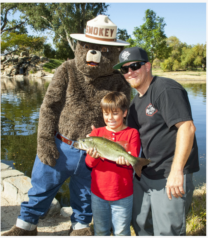
Smokey the Bear joins in the fun.

This press release can be viewed online at: http://www.einpresswire.com