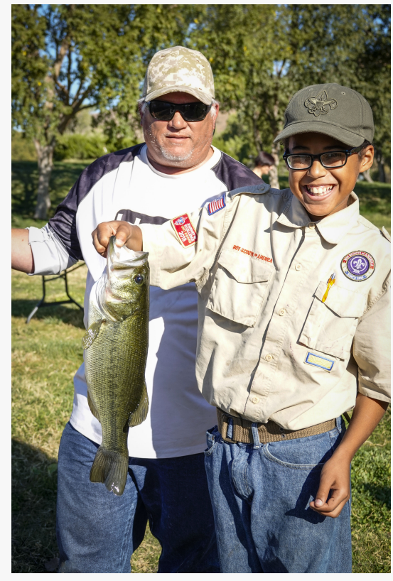
The winning fish in the Boy Scouts league.