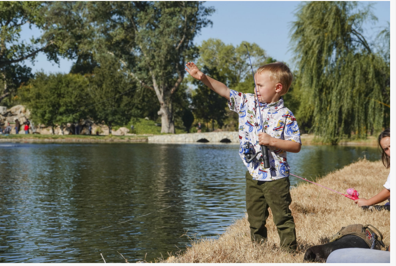
Kids of all ages got hooked on fishing as they learned new skills.

Media Relations Church of Scientology International +1 323-960-3500 email us here Visit us on social media: Facebook Twitter