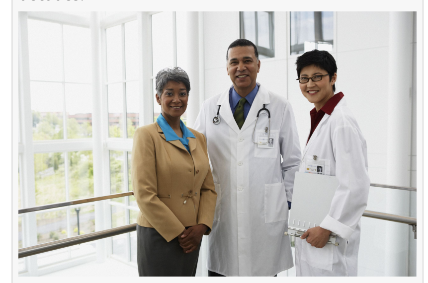
The Steinberg Law Group is affiliated with doctors around the country.