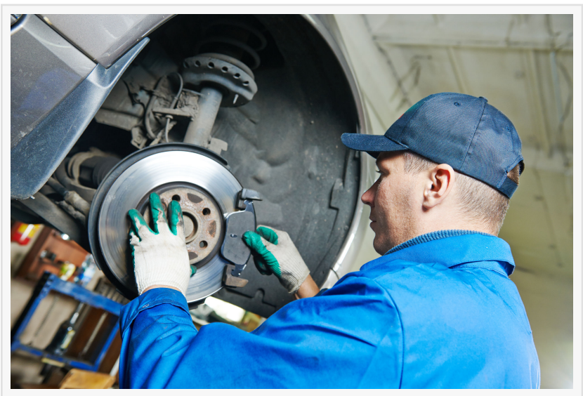
Asbestos was used in numerous automotive parts for decades.