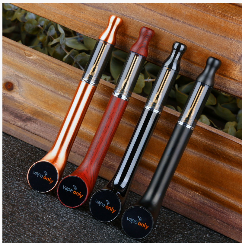
Vpipe Mini Four Colors