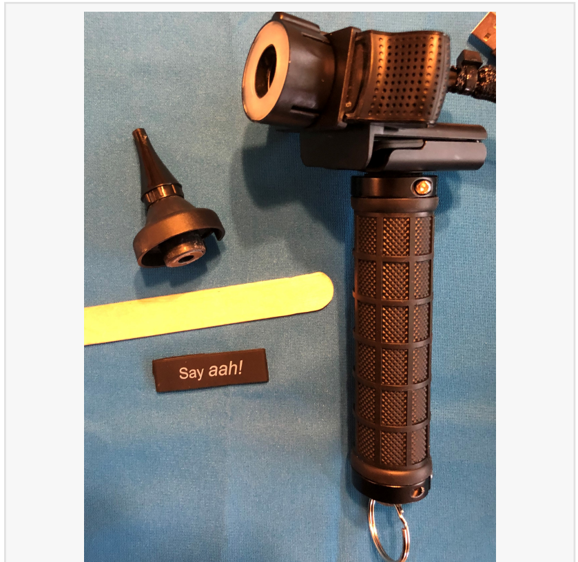
Finished USB Exam Cam with Otoscope

MobilDrTech will offer parts kits for customers who want DIY components and a fully finished plug-and-play Exam Camera that is ready for clinic use right out of the box. The pricing is extremely attractive. MobilDrTech will offer a Logitech C920 Camera with Light Ring Kit for $178 and a kit that also includes the Otoscope Speculum for $277. Fully finished USB Exam Cams are available at only $249 for the base camera and $348 for the Exam Cam with the optional otoscope speculum. See RExCam Kits Datasheet https://cdn.shopify.com/s/files/1/1693/8993/files/RExCam_Datasheet.pdf?74