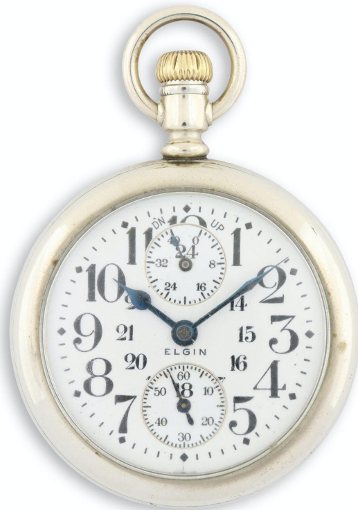
Gold-filled, 23-jewel Elgin Veritas wind indicator pocket watch signed on the movement, dial and case (est. CA$800-$1,200).

This press release can be viewed online at: http://www.einpresswire.com