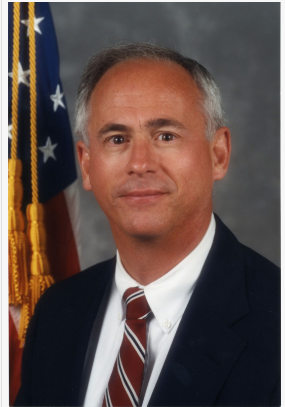
Co-Author, Former FBI Asst. Dep. Director