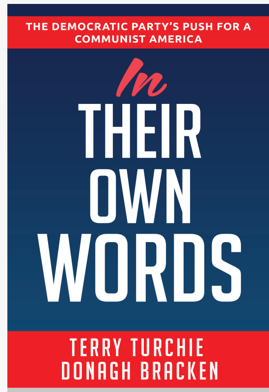
The voices of today's Democratic Party