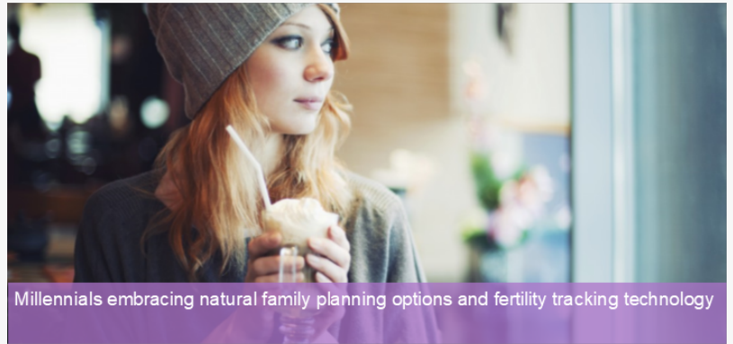
Millennials embracing natural family planning options and fertility tracking technology

EINPresswire.com/ -- As the number of millennials delaying starting a family increases, so does the willingness of millennial women to embrace more natural solutions to their fertility health and wellness. They want to understand their bodies and are welcoming both information and technology around it — and they're using their smartphones to do it.