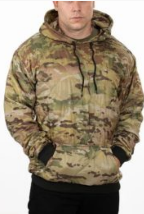
Woobie Official Vet Owned Hoodies

This press release can be viewed online at: http://www.einpresswire.com