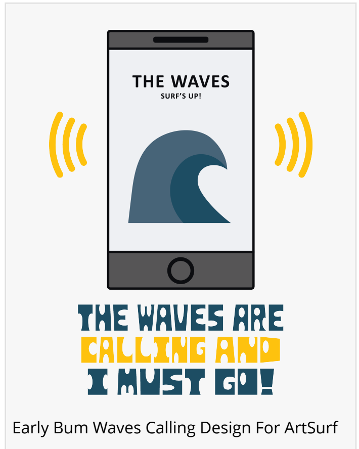
Early Bum Waves Calling Design For ArtSurf

The influence of living at the crossroads of the car culture and surf culture changed how Earl saw the world. Being coated in salt and bleeding motor oil is a life somewhat unique to Southern California. Earl work as an engineer at a plant that built airplanes. Another industry they is deeply rooted in Southern California.