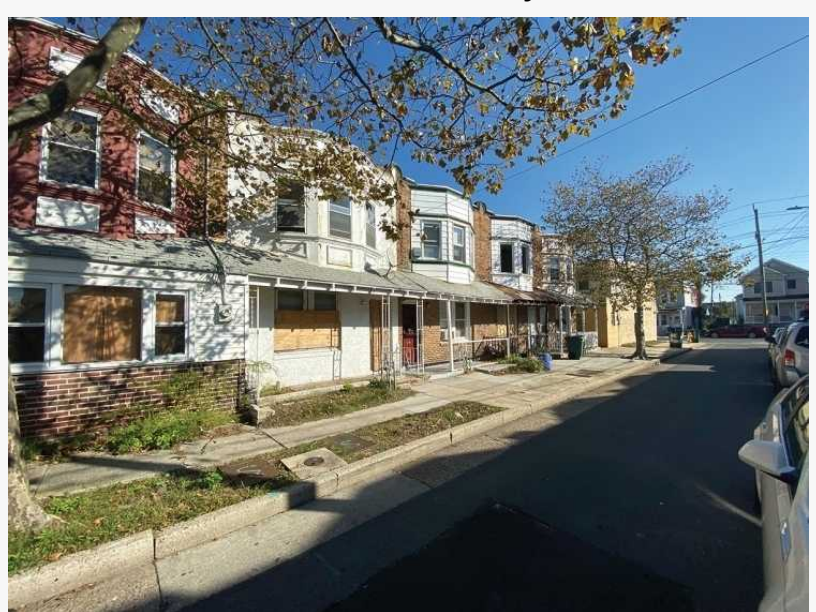
Ready for Renovation

This press release can be viewed online at: http://www.einpresswire.com