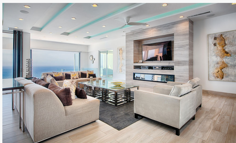
Grand Living Room in Villa Lands End Cabo

With its oceanfront view and elevated perch over the Pacific-side of Pedregal, the freshly remodeled Villa Lands End gazes out on some of the most amazing ocean views that Cabo San Lucas has to offer. The villa is perched 260-feet above the Pacific Ocean, with a stunning rock-cliff vantage point that offers sweeping panoramic views over the Pacific Ocean as well as the pristine Pacific-side beaches, both North and South of the Villa’s vantage point.