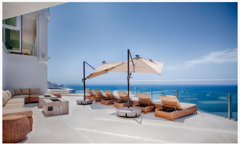
Pool Patio with huge Pacific Ocean view in Villa Lands End Cabo

Villa Lands End features a striking contemporary design and lush, tropical landscaping. Approaching from the entrance is like setting foot in a new world of elegance and soul-soothing grandeur. On the façade, the state-of-the-art villa boasts a wide-open alfresco deck complete with a beautiful negative-infinity-edge swimming pool and a large eight-person Jacuzzi. Adjacent to the pool area is a recreation room with a full kitchen, bar, and billiard/ping-pong table. There are also plenty of lounge chairs and a large sofa facing the dynamic ocean view, a BBQ grill as well as an outdoor fireplace and scores of fire pits.