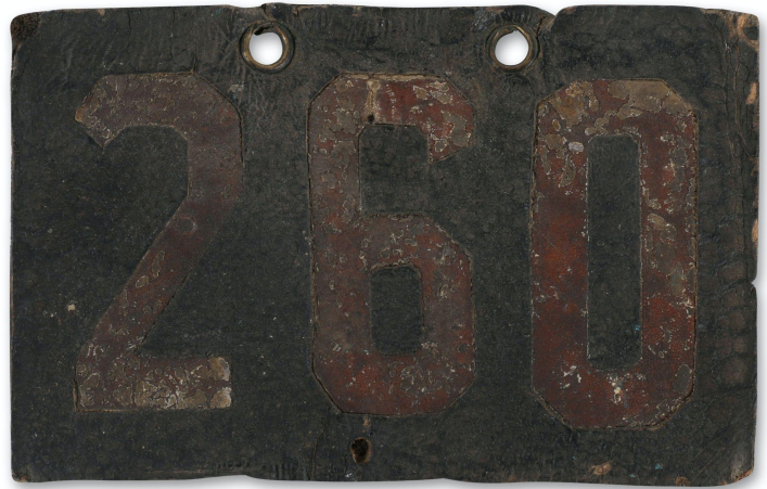
Ontario leather motorcycle license plate from 1907, one of only a few known, with original brass grommets and remnants of the original white paint on the numbers (est. CA$5,000-$7,000).

This press release can be viewed online at: http://www.einpresswire.com