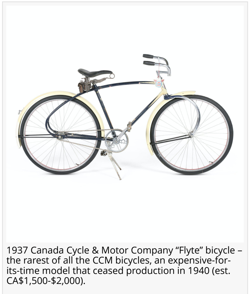
1937 Canada Cycle & Motor Company "Flyte" bicycle – the rarest of all the CCM bicycles, an expensive-for-its-time model that ceased production in 1940 (est. CA$1,500-$2,000).

A 1937 Canada Cycle & Motor Company "Flyte" bicycle – the rarest of all the CCM bicycles, an expensive-for-its-time model that didn't sell particularly well and ceased production in 1940 – carries an estimate of $1,500-$2,000. The limited production has only enhanced its desirability among today's CCM collectors. The bike being sold has an unusual fork and frame design and still has the original "Lucien Bicycle Service" dealer decals and the correct Dunlop chrome rims.