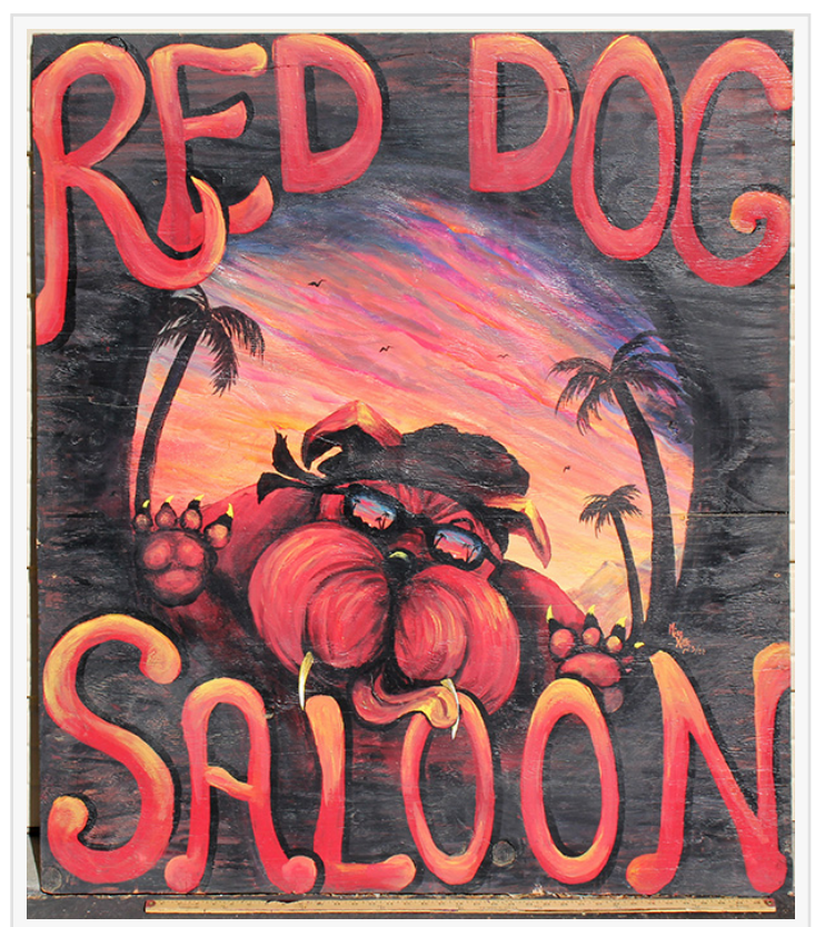
Original oil on board sign for the worldfamous Red Dog Saloon in Virginia City, Nevada, dated 2003, signed by the artist "Miss Kitty", 43 ½ inches by 48 inches, no frame (est. $1,000-$2,500).

Day 1, December 5th, will be the sale's busiest day, in terms of the sheer number of categories. These will include art, militaria, Native Americana, firearms and weapons, general Americana, autographs, antiquarian books, bottles, clothing, comic books, cowboy collectibles, ephemera, entertainment industry, furnishings, 3D items, gaming, jewelry, maps, music and photography. Also offered on Day 1 will be political memorabilia, postcards, saloon/beer/tobacco, spoons, tools, toys, Wells Fargo/Express, World's Fair/Expositions, coins and tokens. An