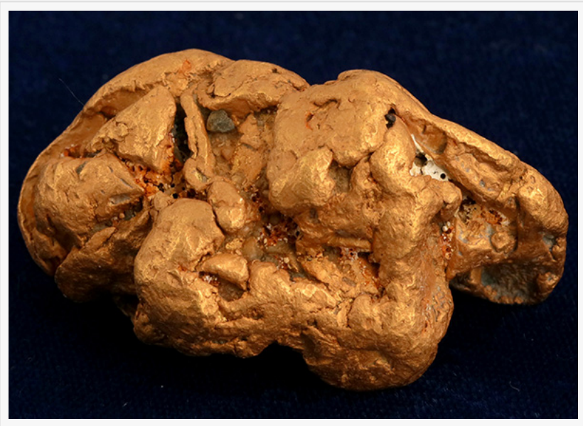
4.51 troy ounce gold nugget from the Atlin mining district, just east of Skagway in Yukon, Alaska, 2 ½ inches by 1 ½ inch (est. $9,000-$14,000).

Other Day 1 highlights will include a quadruple silver plate coffee urn by Wilcox with two elk side mounts and an engraved elk on the front, plus a matching engraved elk tray with inscription (est. $800-$1,500); a rare