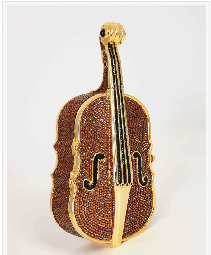
Judith Lieber cello form minaudière (est. $2,000-$3,000).