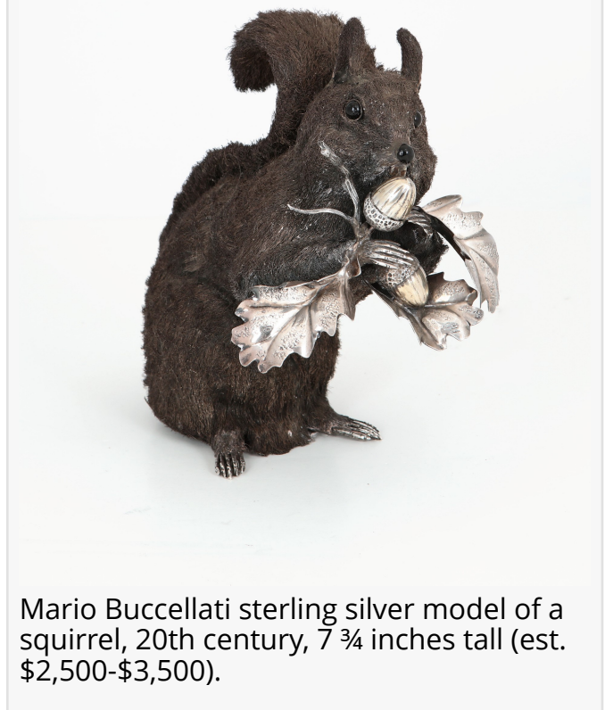
Mario Buccellati sterling silver model of a squirrel, 20th century, 7 ¾ inches tall (est. $2,500-$3,500).