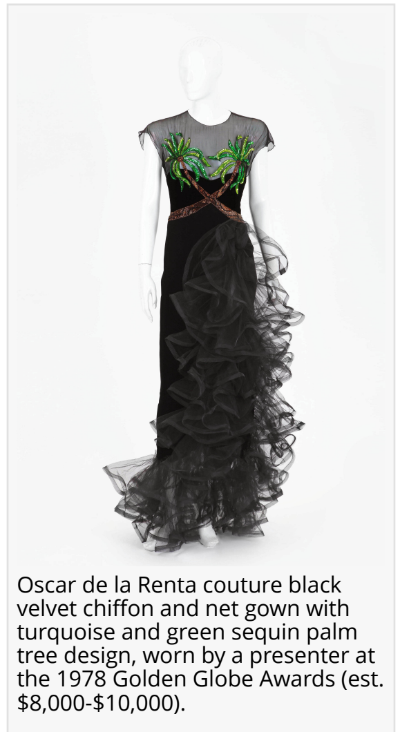
Oscar de la Renta couture black velvet chiffon and net gown with turquoise and green sequin palm tree design, worn by a presenter at the 1978 Golden Globe Awards (est. $8,000-$10,000).

The uniquely Florentine hardware on the Ferragamo Giancini silver metallic bag (est. $1,000-2,000) is iconic. Also offered will be an unusual cello form minaudière Judith Lieber clutch (est. 2,000-3,000), a vintage Louis Vuitton Alzer 70 hard sided suitcase (est. $600-800), Mont Blanc