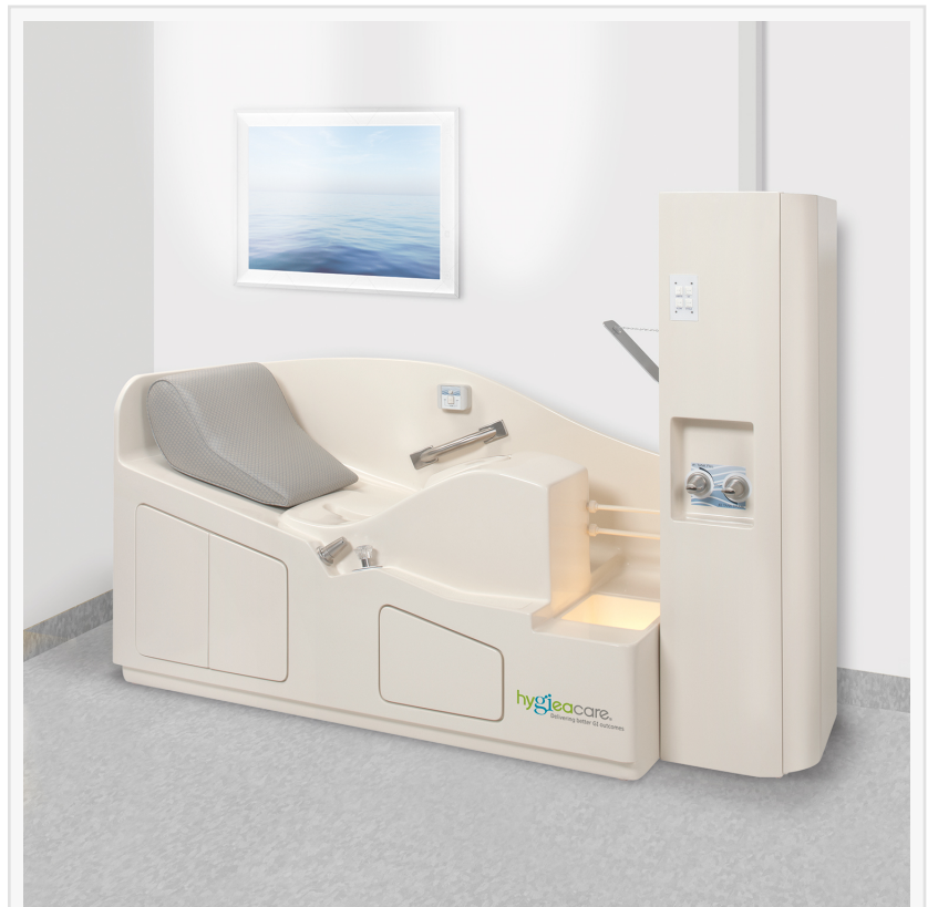
odorless and acoustically protected HyGleaCare experience

About Austin Gastroenterology Austin Gastroenterology is the first and largest group of physicians in Central Texas specializing in the diagnosis, treatment, and prevention of gastrointestinal diseases. AG is one of Texas' most trusted names in gastroenterology, and has earned the reputation as Central Texas' best choice for internal health, with expertise in gastroenterology, capsule endoscopy, irritable bowel disease (IBD), hepatology (liver), hepatobiliary systems and research. AG has more than 35 board-certified GI physicians providing care from Georgetown to Kyle and all points in between. For more information on Austin Gastroenterology, please visit https://www.austingastro.com/ .