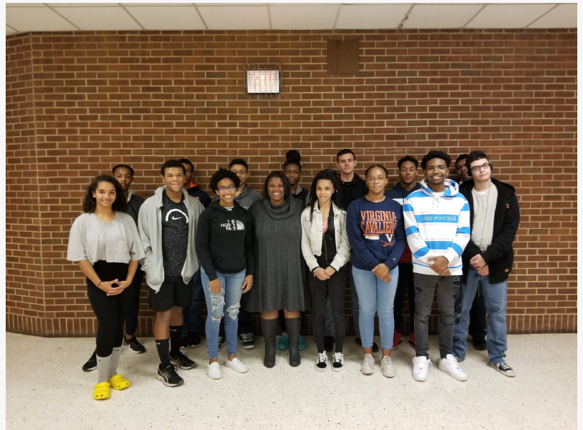
UVA Equity Center College Application Event