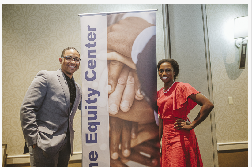
UVA Equity Center - Giving Thanks Community Dinner

Generations of local leaders have worked to address pervasive and persistent inequity; in education, housing, health and elsewhere. A new University of Virginia initiative brings university resources to join local leaders in creating an environment that provides equitable opportunity for every member of the Charlottesville community. The university will partner with the community to advance social justice.