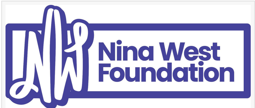
NINA WEST FOUNDATION LOGO

“The holiday season can be difficult for so many in the LGBTQIA community.”. Said Nina West. “With this tremendous platform given to me by RuPaul’s Drag Race, I wanted to continue to lift up and elevate my community, and what a better way to do that than to help celebrate organizations that do just that. I hope this will motivate fans of the show to give what they can-time, talent, or treasure - during the holiday season. And, if people are moved by the work of the Nina West Foundation, I hope they will consider donating to help us further our mission of