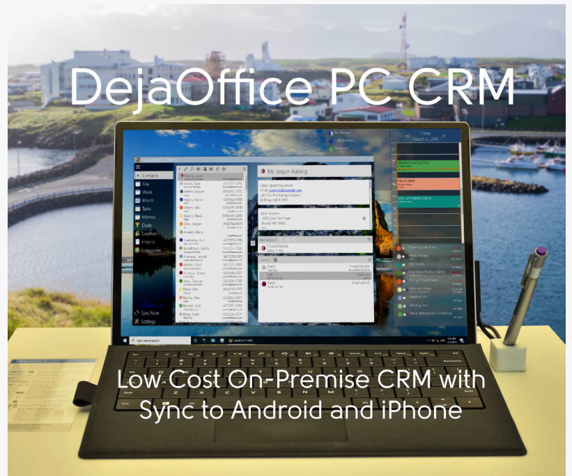
DejaOffice PC CRM - Affordable On-Premise CRM with Android and iPhone Sync

This press release can be viewed online at: http://www.einpresswire.com