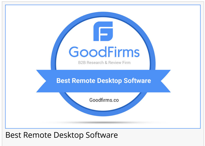
Best Remote Desktop Software

to choose for their business or personal use. For the same reason, GoodFirms unlocks the list of Best Remote Desktop Software based on multiple research factors.