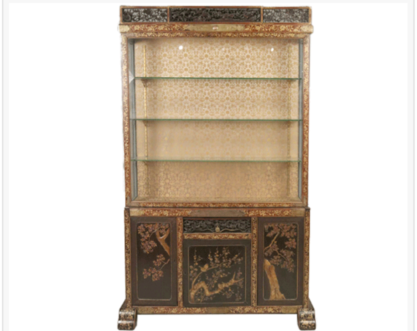
20th century Chinese Export carved hardwood display cabinet, 6 feet 11 inches tall by 4 feet 2 inches wide.