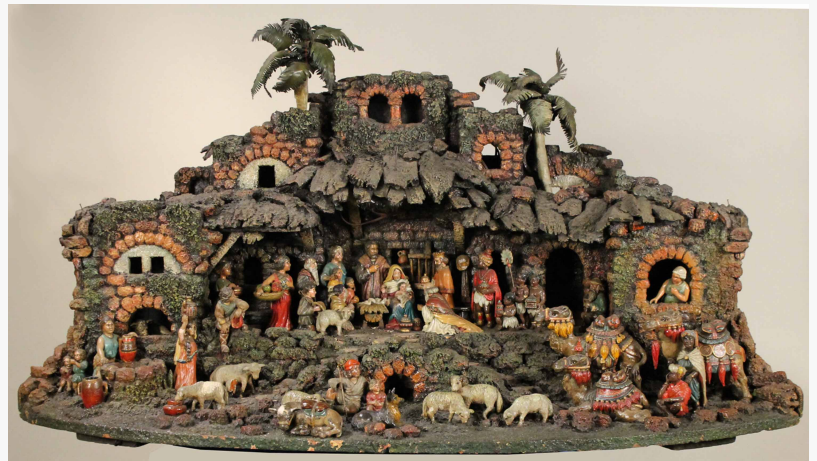
European 19th century carved wood Precepio depicting a Nativity scene, 32 inches tall by 60 inches wide by 24 inches deep.

This press release can be viewed online at: http://www.einpresswire.com