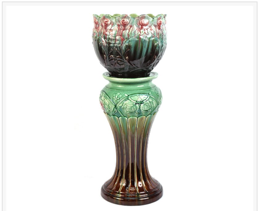
A private Westchester County, New York collection offers a broad selection of vibrantly colored and designed Majolica jardinières, including this Calla Lily piece with stand.