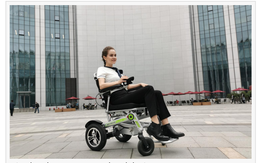
Airwheel H3T smart wheelchair

With the development of society and the improvement of human civilization, people, especially disabled people, are increasingly required to use modern high technology to improve their quality and freedom of life. While innovation has been an important part of Airwheel's legacy, our highest priority has always been customer satisfaction. So, Airwheel H3T automatic folding wheelchair was born and it is super easy to operate. The intelligent controller on the handlebar includes all basic functions, accelerating, decelerating, lighting, horns and folding, unfolding. The direction is controlled by the joystick, which ensures everyone can sit and go.