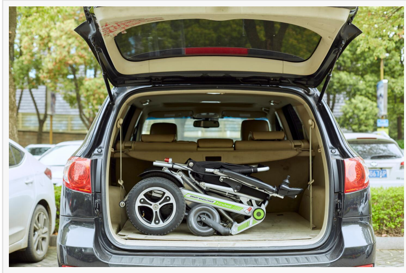
Airwheel H3T electric(power) wheelchair

Safety is extremely important no matter for which product. The H3T power wheelchair uses the EABS electromagnetic brake. When the handle is released, it will brake immediately. Even on the slope, it can guarantee the parked state without slipping. When reversing, the horn will automatically sound a warning tone to remind surrounding passers-by and vehicles to avoid it in time. The rear side is also designed with a multifunctional anti-dumping wheel, which can effectively prevent the wheelchair from falling over when going up and down and backwards, and can also be used as an arm-brace when folding.