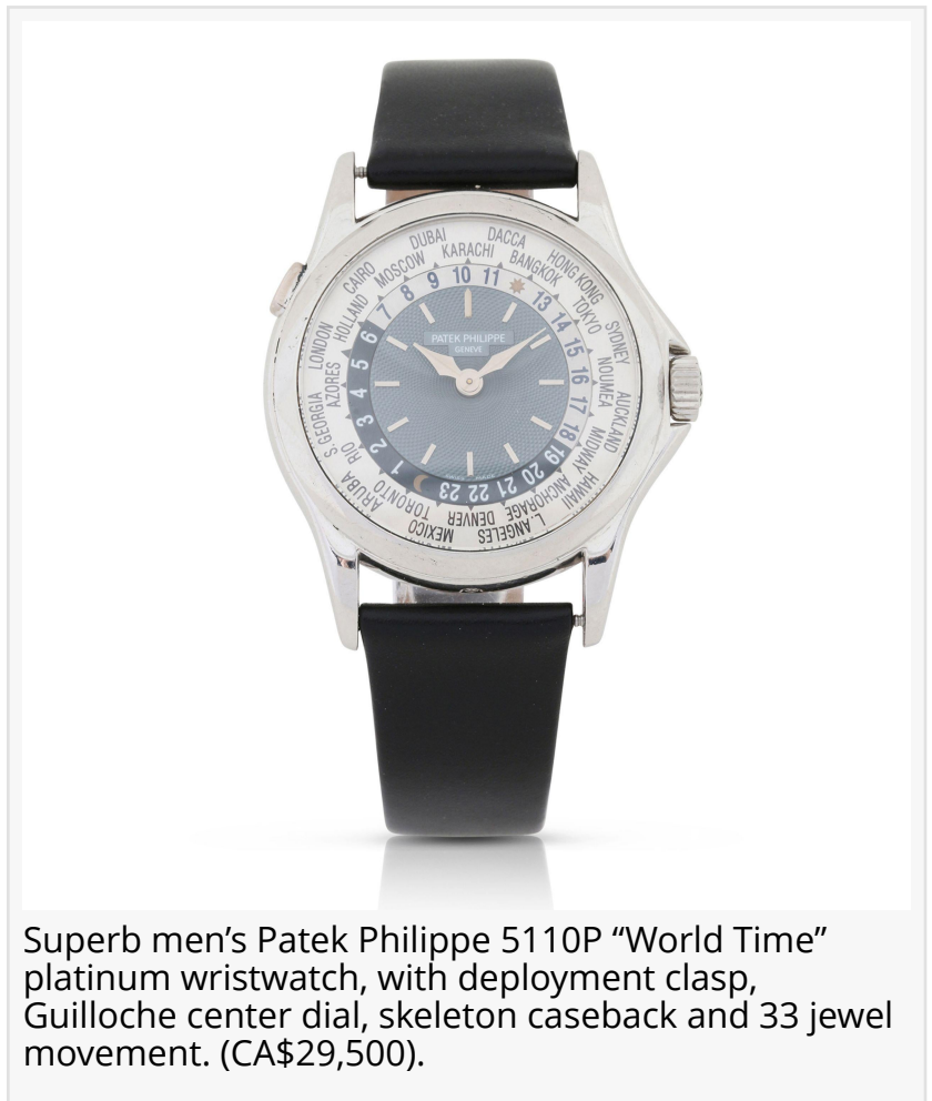
Superb men's Patek Philippe 5110P "World Time" platinum wristwatch, with deployment clasp, Guilloche center dial, skeleton caseback and 33 jewel movement. (CA$29,500).

The men's Patek Philippe 5110P "World Time" platinum wristwatch featured a deployant clasp, Guilloche center dial, skeleton caseback and marked 33 jewel movement. It came in the original mahogany presentation box with inlaid brass Calatrava lid. The 18kt gold ring claw-set with a 4.25-carat solitaire diamond exhibited good-medium cut and came with a certificate of appraisal.