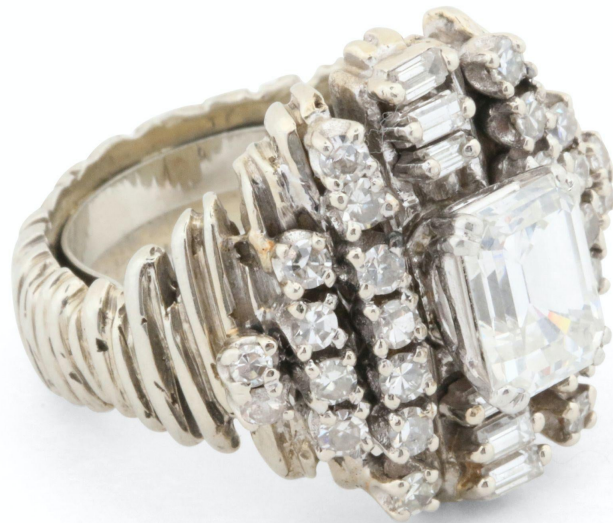
18kt white gold ring containing one 2.38-carat emerald cut center stone with VVS2 clarity and H color, surrounded by 30 high-quality baguettes and round brilliant cut diamonds (CA$8,610).

This press release can be viewed online at: http://www.einpresswire.com