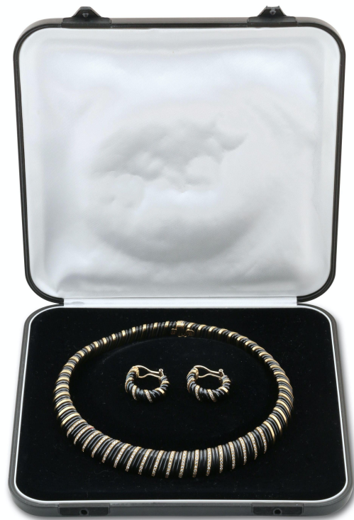
Sabbadini 18kt gold diamond necklace and earrings set, marked "Sabbadini .750 Made in Italy - Accia 10 FORO" on the inner clasp, about 15 inches in length (CA$3,998).