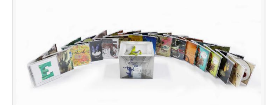
Bill Bruford's Earthworks - Earthworks Complete