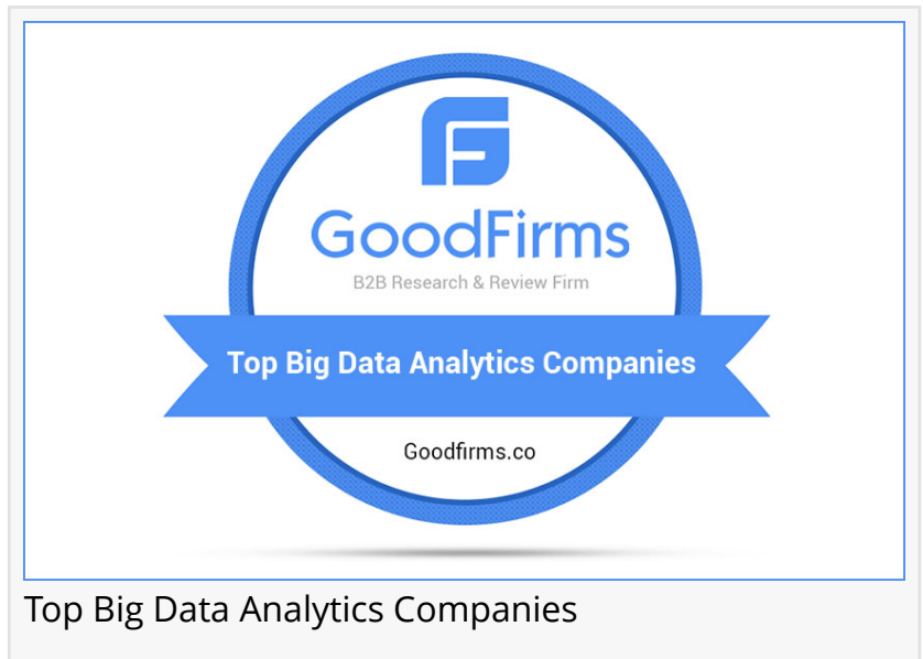
Top Big Data Analytics Companies

challenges due to the highly competitive market. Therefore, GoodFirms has highlighted the list of Top Big Data Analytics Companies based on several qualitative and quantitative parameters.