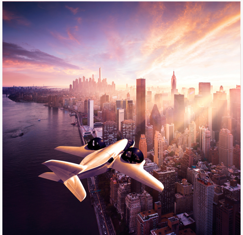
Long Distance Point to Point Travel