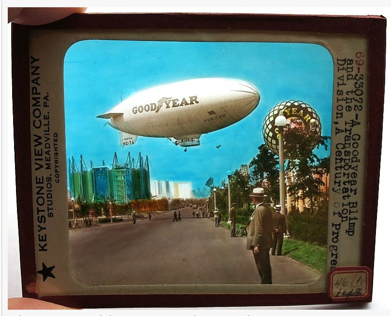
Chicago World's Fair Good Year Blimp - 1933