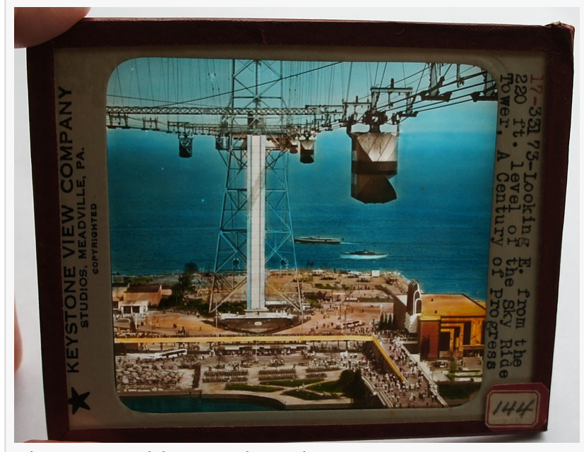
Chicago World's Fair Sky Ride - 1933

Our company has been featured on CNBC, USA Today, Bloomberg, Associated Press, Reuters, Nightline, Today Show, Baltimore Sun, and Washington Post and in many other media publications. The company also offers the World's #1 old stock research service at OldCompany.com and offers high resolution scans for publications. Scripophily.com has over 16,500 selections on its website.