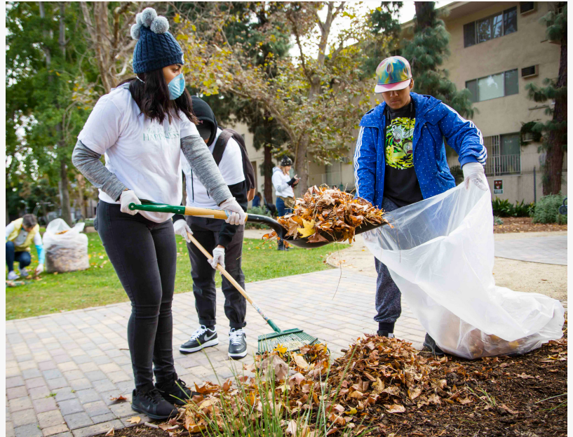
Volunteers young and old joined in the effort to make the parade route perfect.

September 2019 Hollywood Village cleanup by a local entrepreneur. Homeless people are invited to join the action by collecting trash and bringing it to four weigh stations where they are paid for their work in cash. To add to the holiday spirit, Hollywood Village organized a special lunch for those participating in Cash for Trash this month, thanks to the generous help of local businesses. There were sandwiches provided by Sysco Foods, Which Witch Superior Sandwiches and