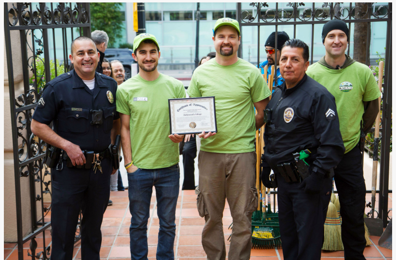
The L.A. Police Department recognized the volunteers with a Certificate of Appreciation for their work.