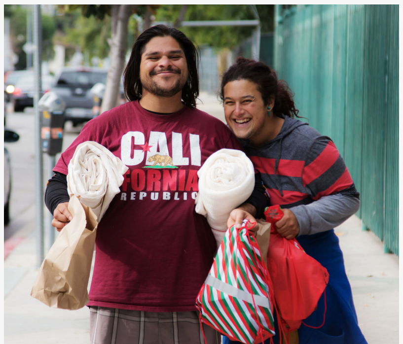
Happy Cash for Trash participants with their new blankets and Christmas-colored bags of hygiene supplies and toiletries.

For more information, visit the Scientology Newsroom .