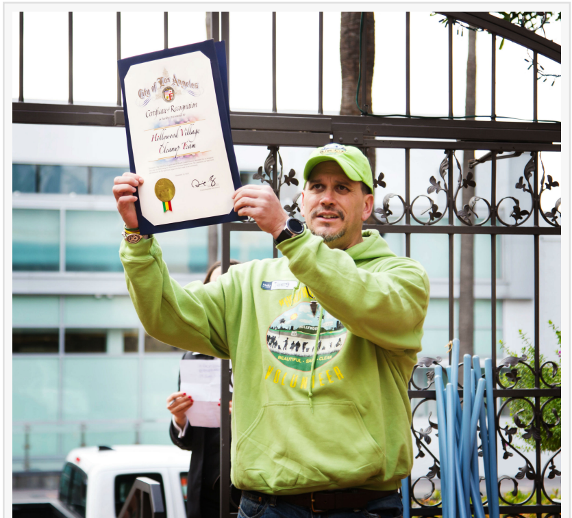
The City of Los Angeles also recognized the work of Hollywood Village.

Media Relations Church of Scientology International +1 323-960-3500 email us here Visit us on social media: Facebook Twitter