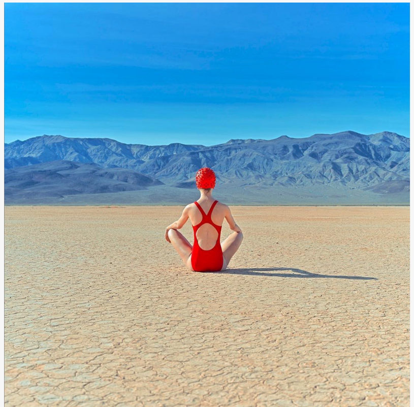
Maria Svarbova "Mountains" 2019, Archival Pigment Print, 35 2/5 x 35 2/5 in