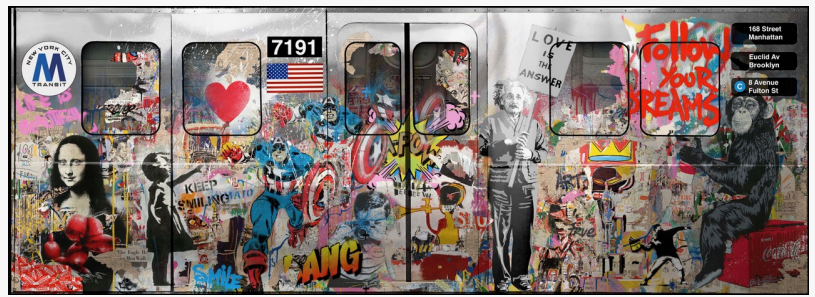
Mr. Brainwash "Subway" 2019, Mixed Media on Aluminum, Plywood and Plexiglass Multi Panel Train, 72x200in.

the art scene not only in Los Angeles, where the show was held, but worldwide. This phenomenal exhibition skyrocketed Mr. Brainwash's popularity. His artistic evolution is chronicled in the Academy Award nominated documentary, Exit Through the Gift Shop, coincidentally directed by Banksy. Known for his stylistic combination of pop and street art, Guetta