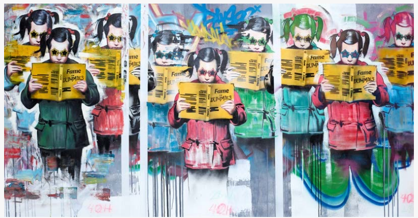
Hijack "Fame Girl" 2019, Mixed Media on Canvas, 52x100 in.

Through his massive paper plane installations made out of aluminum and stainless steel sculptures, Daniele Sigalot is gaining critical acclaim in the fine art world, with major museum shows highlighting his talent. The center of his research spins around the ambiguity between the perception of the materials he uses and their actual nature. His iconic paper plane installations appear ephemeral at first glance, but are in actuality hand-crafted out of metal. This year will be