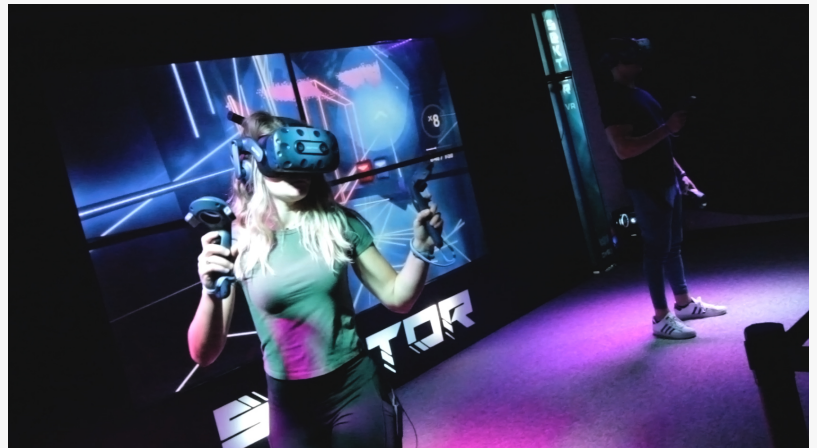
130" display conveys all the action

HOUSTON, TX, UNITED STATES, December 3, 2019 /EINPresswire.com/ -- As the majority of the population still hasn't tried Virtual Reality, availability of the complicated and expensive hardware in amusement venues has been good for expanding the reach of the burgeoning medium. Pushing the limits of location-based entertainment (LBE) we find Sektor, a VR arcade arena in which players enter a whole new realm of gaming. While the VR arena concept itself is not new, Sektor improves upon the status quo with cutting-edge tech, including