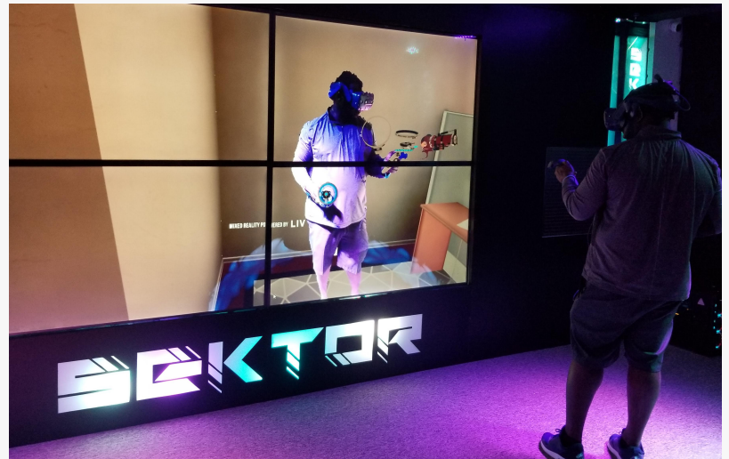
Mixed reality game capture on the large display

This press release can be viewed online at: http://www.einpresswire.com