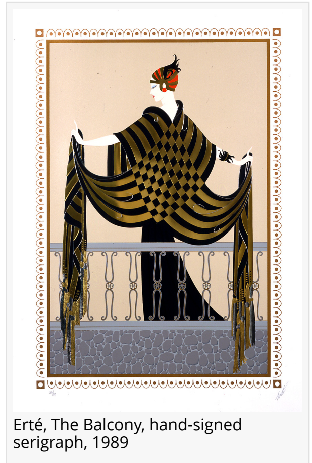
Erté, The Balcony, hand-signed serigraph, 1989

Chalk & Vermilion Fine Arts, MLG's parent company, began publishing Erté's limited edition graphics in 1982. The printing methods utilized a bar set and remain an industry standard for greatness in serigraph printmaking. The combination of industrial foil stamping to produce