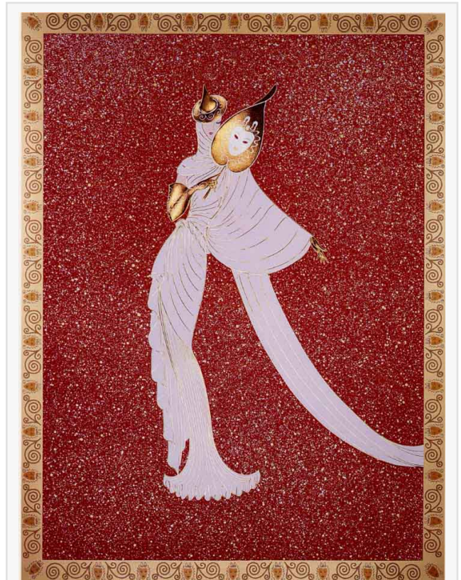
Erté, Tangra (Red) 1989, hand-signed serigraph