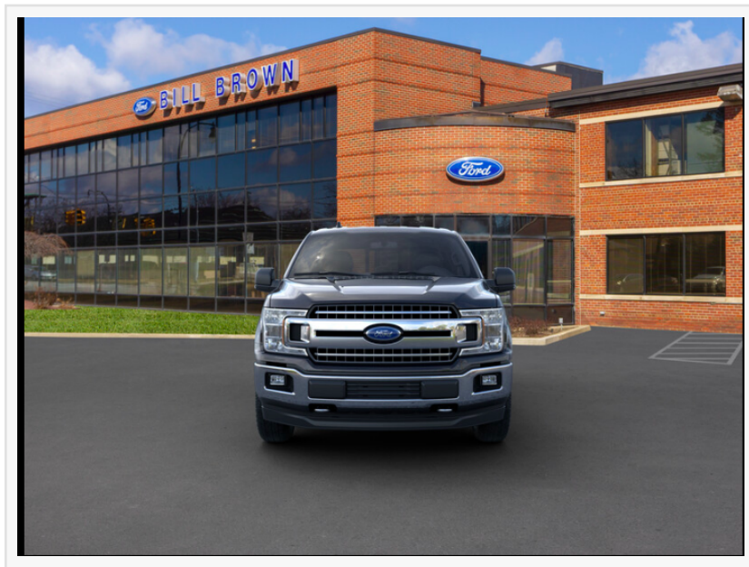
You Always get the best deal on Ford vehicles from Bill Brown Ford in Livonia, MI

As one of the top dealerships in the United States, Bill Brown Ford has won numerous awards including the highly