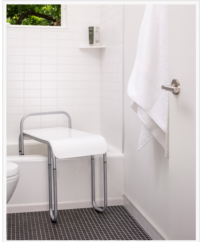
The Judith Bench provides secure seating for bath or shower. The cashmere-feel seat texture allows even fragile skin to glide easily across, and the removable storage caddy keeps supplies within reach. The waterfall seat allows for convenient transfer from a wheelchair.

Shelly Dvorak Sphere 421 +1 952-250-7965 email us here Visit us on social media: Facebook Twitter LinkedIn