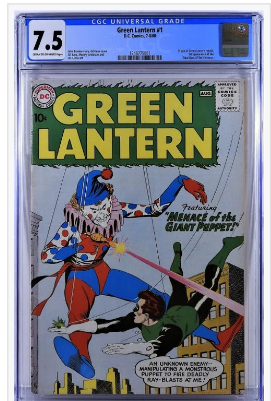
Copy of DC Comics' Green Lantern #1, from July-August 1960, recounting the origin of Green Lantern, graded CGC 7.5 out of 10 for condition (est. $1,500-$2,000).

Travis Landry Bruneau & Co. Auctioneers +1 401-533-9980 email us here