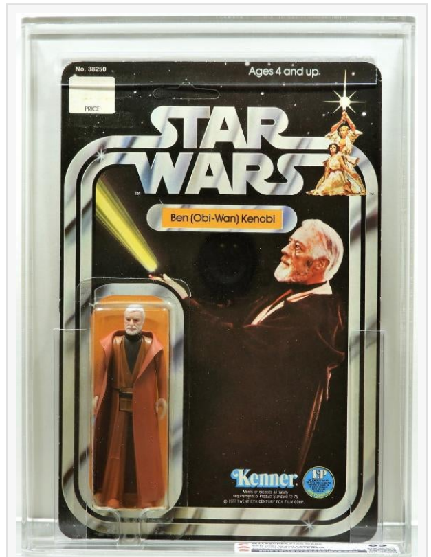
1977 Kenner Star Wars 12 Back Ben Obi-Wan Kenobi card, unpunched, the figure a white hair variant, SKU number of footer card, graded CAS 85 (est. $1,000-$1,500).

The 1977 Kenner Star Wars Vinyl Cape Jawa figure, graded CAS 85, is an excellent example with vivid color and is housed in a CAS case. The 1978 Kenner Star Wars Cantina Adventure multi-pack Blue Snaggletooth and Greedo figures, graded CAS 75+, with the Snaggletooth a dented toe variant, is also contained in a CAS case. Both lots are expected to hit $1,500-$2,500.