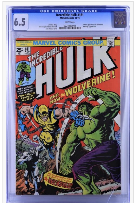
Copy of Marvel Comics' Incredible Hulk #181, from November 1974, graded CGC 6.5, with white pages, featuring the first full appearance of Wolverine (est. $1,500-$2,000).