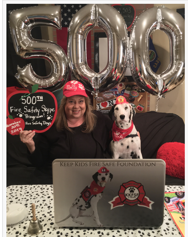
Molly the Fire Safety Dog Recently Skyped the Keep Kids Fire Safe Foundation's 500th Fire Safety Skype Program

"Molly's fire safety Skype program is a powerful way in which children and their families learn about the importance of knowing what to do in case of