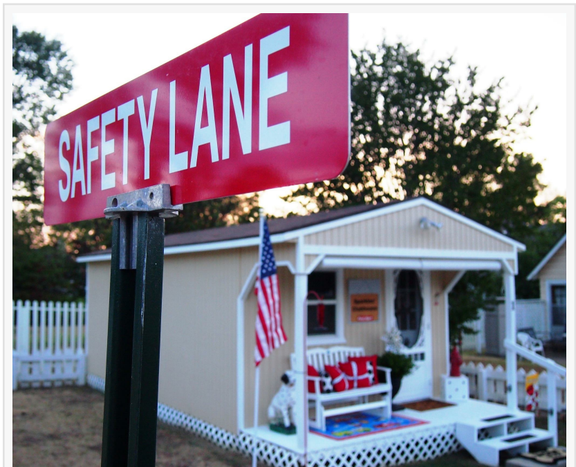
Molly the Fire Safety Dog Skypes her fire safety program from her clubhouse in Clarksville, Arkansas