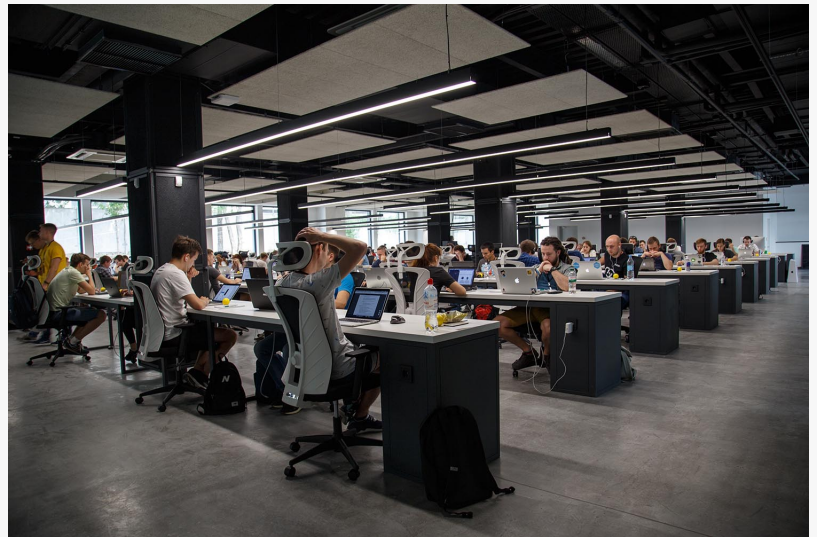
Best CCaaS | UCaaS