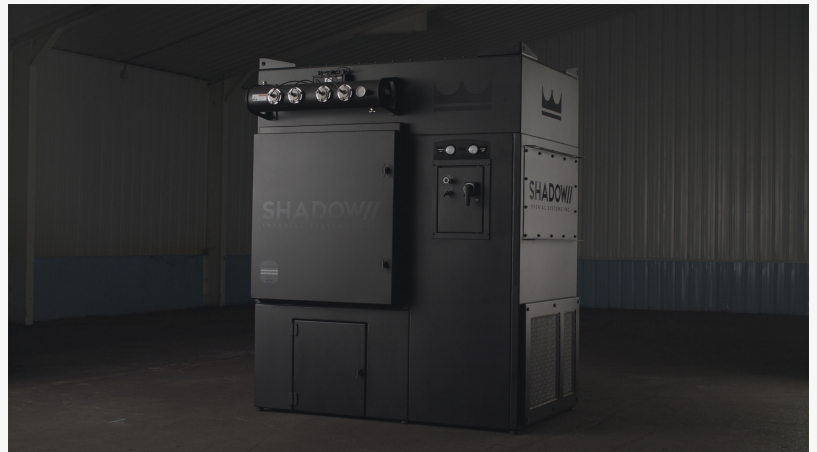
Shadow Compact Fume Extractor

Please contact us at Imperial Systems to find out if the Shadow Compact Fume Extractor is a good solution for your dust and fume control needs.