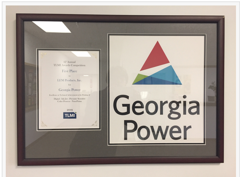
Award Winning Fleet Decal for Georgia Power Designed and Manufactured by LEM Products, Inc.