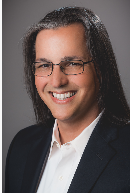
Author Photo Greg Mullen

This press release can be viewed online at: http://www.einpresswire.com