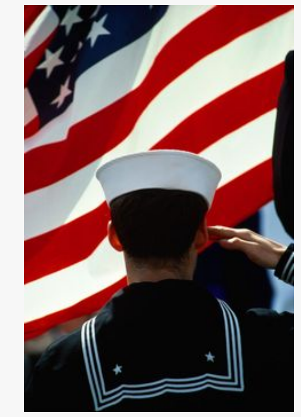
US Navy Veteran 21

exposure to asbestos in the navy, at a shipyard or while working at a factory, at power plant, public utility, or as a plumber, electrician welder, mechanic or any kind of skilled trades group in any state please have them call us anytime at 800-714-0303. Most people like this never get compensated-even though the asbestos trust funds were set up for them too. We are trying to change this sad fact." <a href="https://USNavyLungCancer.Com">https://USNavyLungCancer.Com</a>