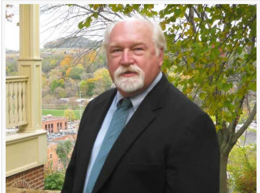
Fawell for Congress

This press release can be viewed online at: http://www.einpresswire.com