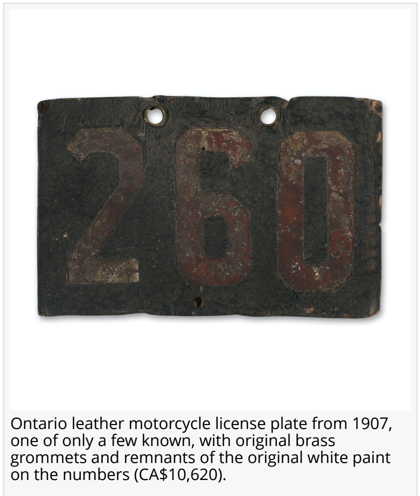
Ontario leather motorcycle license plate from 1907, one of only a few known, with original brass grommets and remnants of the original white paint on the numbers (CA$10,620).

The leather motorcycle plate, extremely rare, measured 6 ½ inches by 4 inches and was listed in the 1910 directory as issued to Walter H. Gurd, 185 Dundas Street in London, Ontario. The Orange Crush single-sided lithographed tin sign, a recent find, was 59 inches by 35 inches. It was marked "C-12N - St. Thomas Metal Signs Ltd., St. Thomas, Ont" on the lower center edge.