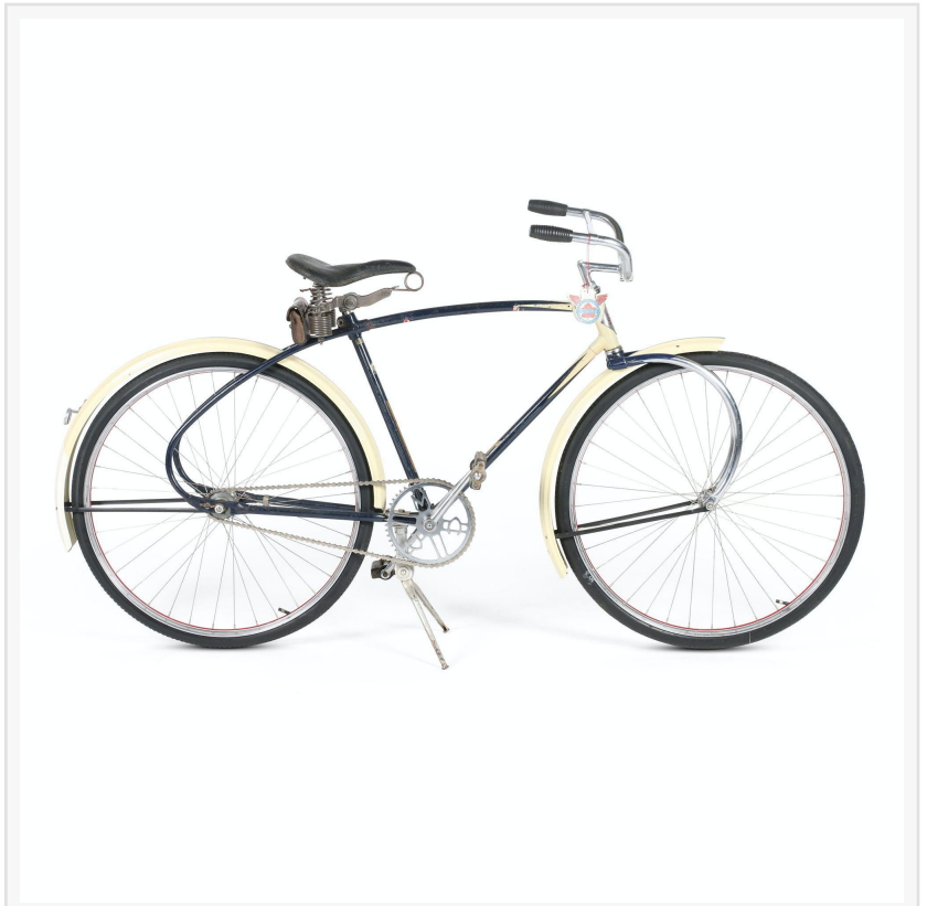
1937 Canada Cycle & Motor Company "Flyte" bicycle – the rarest of all the CCM bicycles, an expensive-for-its-time model that ceased production in 1940 (CA$3,600).