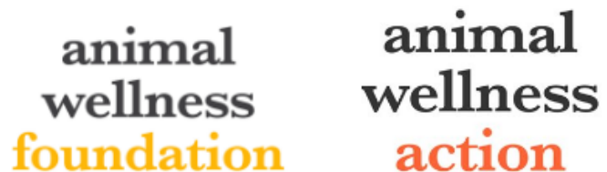
Animal Wellness Brands Logo