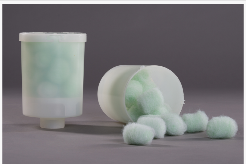
EGO3 hot-tub-filters multiuse cartridge with hot tub filter material

The only hot tub filter with 4 months MONEY BACK WARRANTY if you are not satisfied. 1. filter cheaper - YES, washable, reusable and it only needs to replace the filter material by simply replacing the filter balls and not the whole hot tub filter every time. can be exchanged.