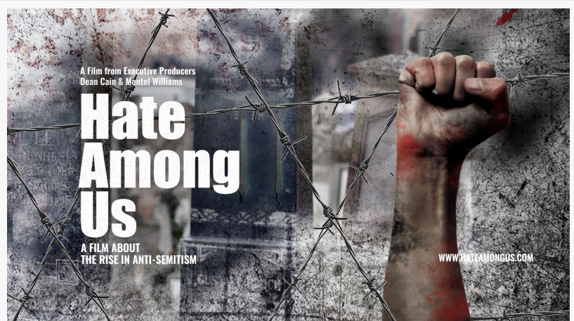
Hate Among Us

POPSTAR! TV is proud to be a presenting sponsor for The Impact Humanity Television and Film Festival, which highlights those films and television programs that emphasize human rights issues, preserves and advances humanitarian causes, and raise awareness on the issues related to the global humanitarian crisis. These key television shows, feature films, and documentaries are selected for their excellence and raising awareness of human rights their compelling stories. The first film "Hate Among Us" , connects real stories of current survivors of violent anti-Semitism