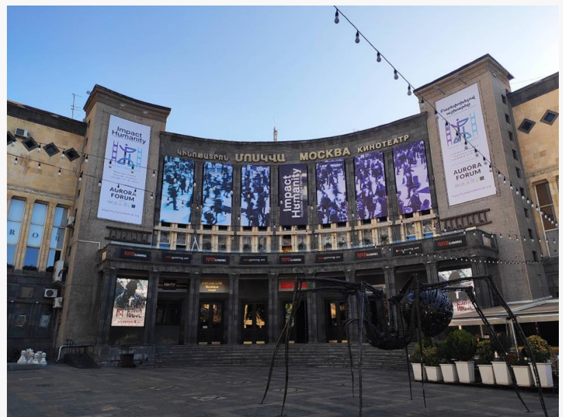
Impact Humanity Film and Television Festival