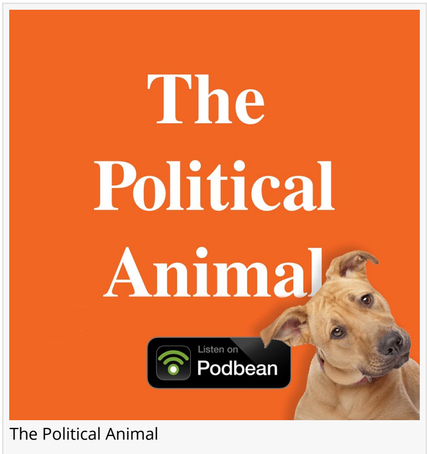
The Political Animal

We hope you'll also listen to Episode 2: 2019 Shark finning, horseracing, and the PACT Act , which also includes a layered discussion of how the committee process works and why it's so difficult to even get a common sense measure into law. And if you missed our first episode, you can listen to Episode 1: 2019 Victories for Animals, by clicking here.