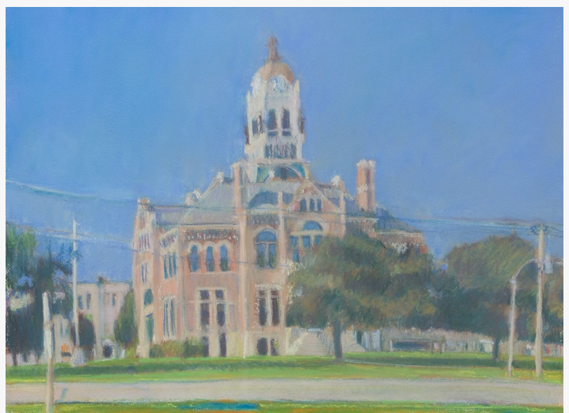
Pastel on paper by Jyothi Basu (Indian, b. 19600, titled The Chosen One, 2004, 20 ½ inches by 15 ¾ inches, artist signed lower right (est. $3,000-$5,000).

An admiration for the intimacies that can be found in world localities is revealed in Margaret Leahy’s (American, 20th century) acrylic Brooklyn Backyard, 1981, which depicts a window’s view