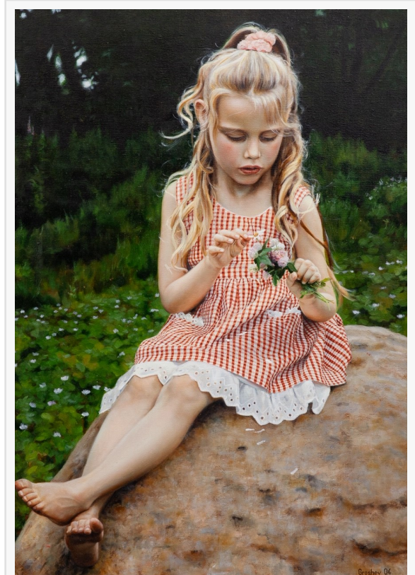
Oil on canvas by Slava Groshev (Russian, b. 1968), titled Chamomile and Clover, 2004, 39 ¾ inches by 27 ¾ inches, signed and dated twice, titled in English and Cyrillic (est. $3,000-$5,000).